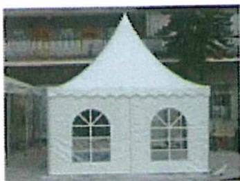
PVC window sidewalls