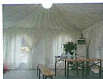
Lining and curtain